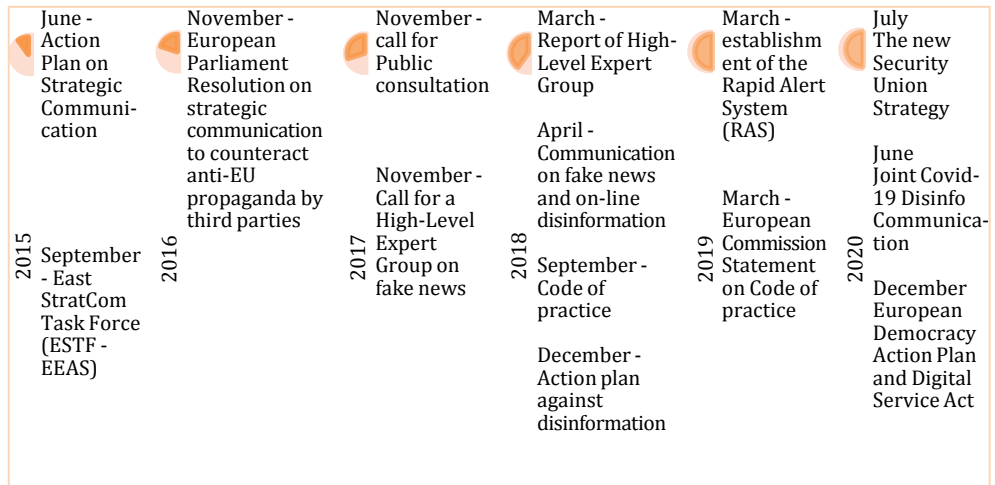
Figure 1: EU key-actions timeline to counter disinformation (Authors' idea)

The results of the Eurobarometer, the “Report of the High-Level Expert Group”, together with the results of the public consultation feed into the European strategy on how to tackle the disinformation presented on 26 April as “European Commission Communication. Tackling online disinformation: a European approach”(April Communication, 2018). It outlined the key principles and objectives in order “to raise public awareness about disinformation and tackle the phenomenon effectively, as well as the specific measures”, including the “support for an independent network of fact-checkers”. (April Communication, 2018)